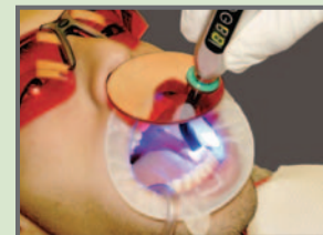
This new curing light was purchased from an online source for $9!

The following report shows the features and performance of 11 inexpensive LED curing lights and compares them to premium lights with proven clinical performance.