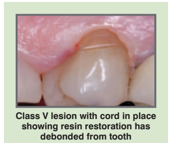
Class V lesion with cord in place showing resin restoration has debonded from tooth