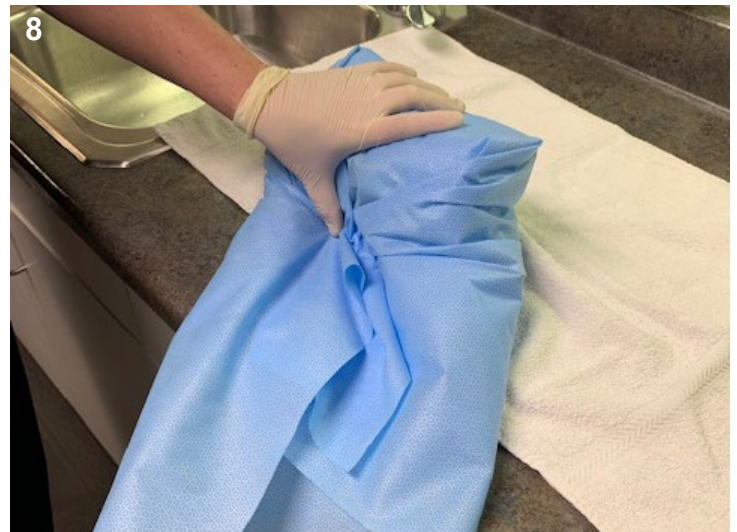
Left apex now folded to middle secured with thumb