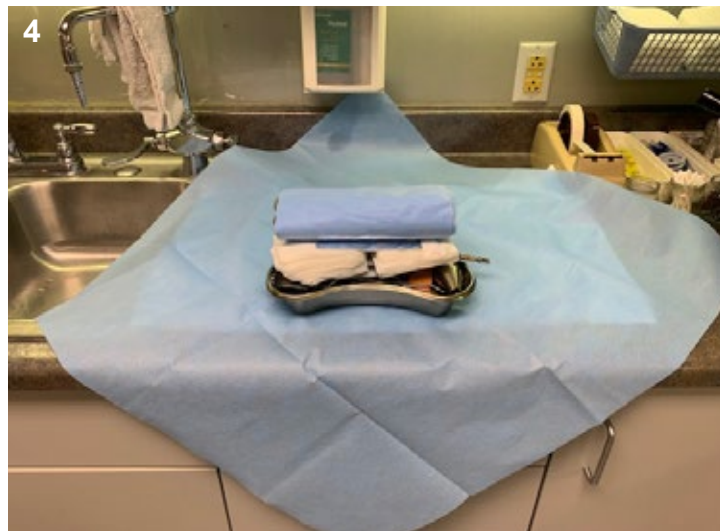
4 Instruments, gauze, hose, placed diagonally on wrap