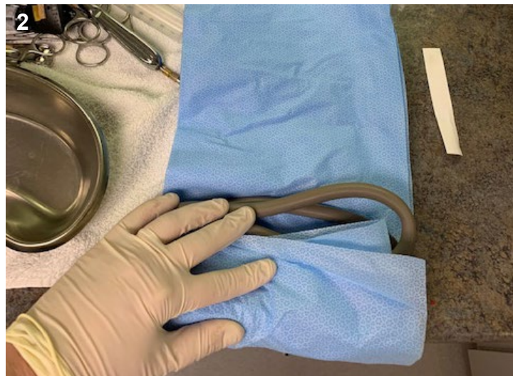
2 Hose to be rolled in folded 30"×30" autoclave wrap (this wrap will be used as a sterile patient drape)