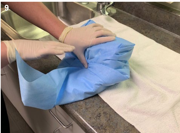
Fourth fold right apex folded to middle