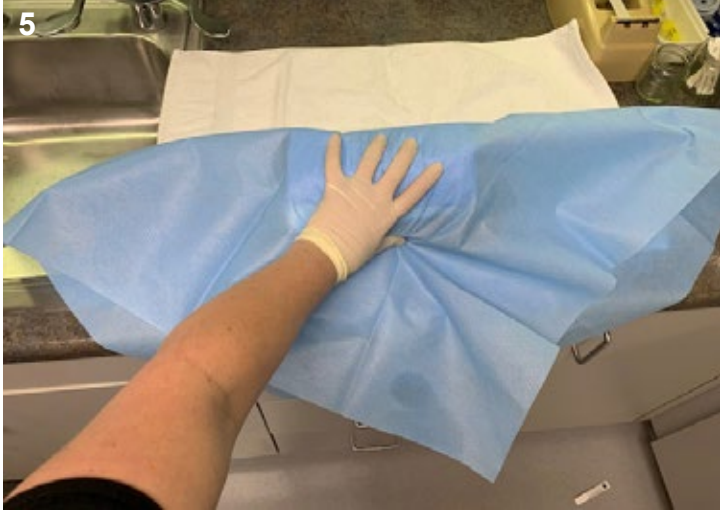
First fold from top apex secured with thumb