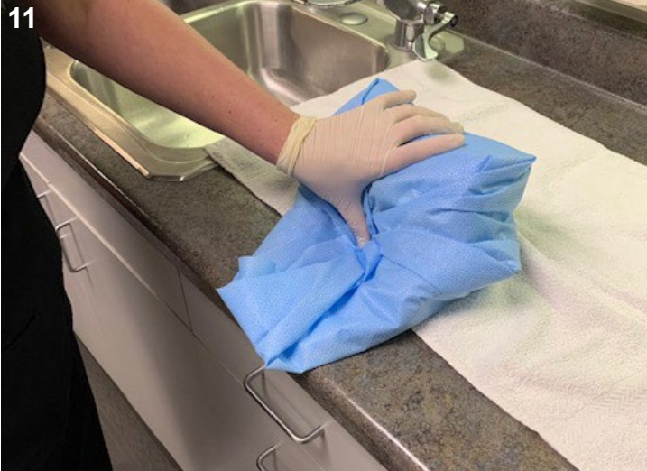
11 Fifth fold tail folded to thumb