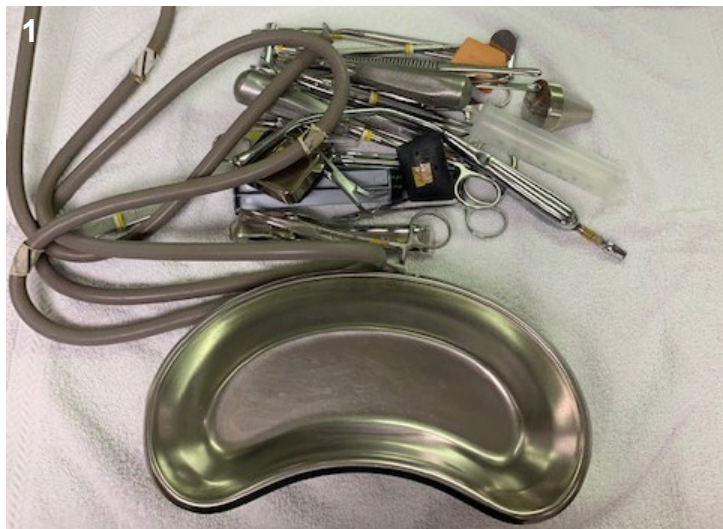
1 Washed instruments and suction hose ready for wrapping on a 24"×24" autoclave wrap to be used when opened as a sterile working surface for the bracket table