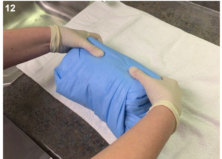
12 Sixth fold rolled to top