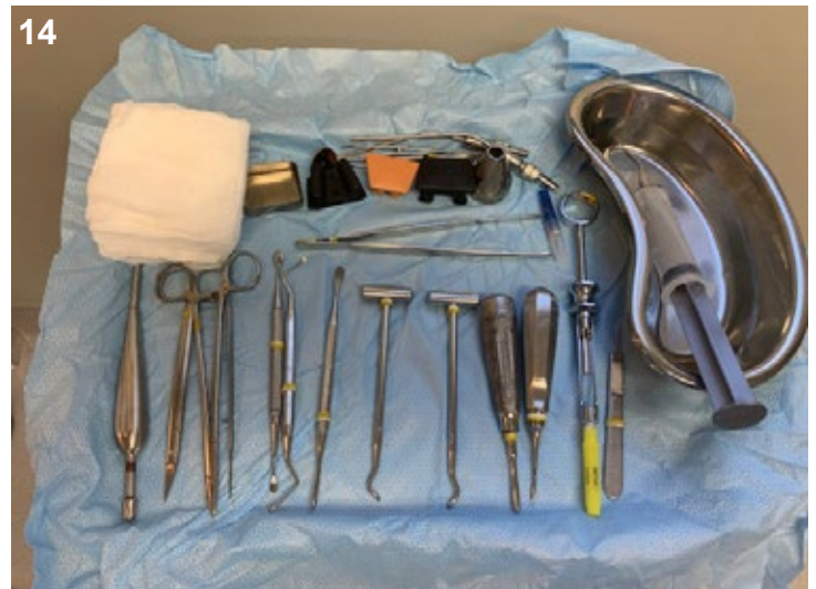
14 Opened sterile pack

Pack can be opened with reversing order so that the working surface is not touched other than apex tips thus producing a working surface that is a completely sterile.