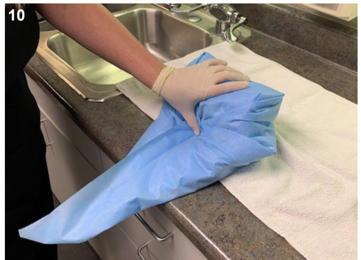
Folded right apex creating a tail