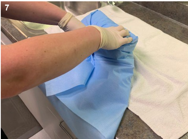
Third fold left apex folded to middle