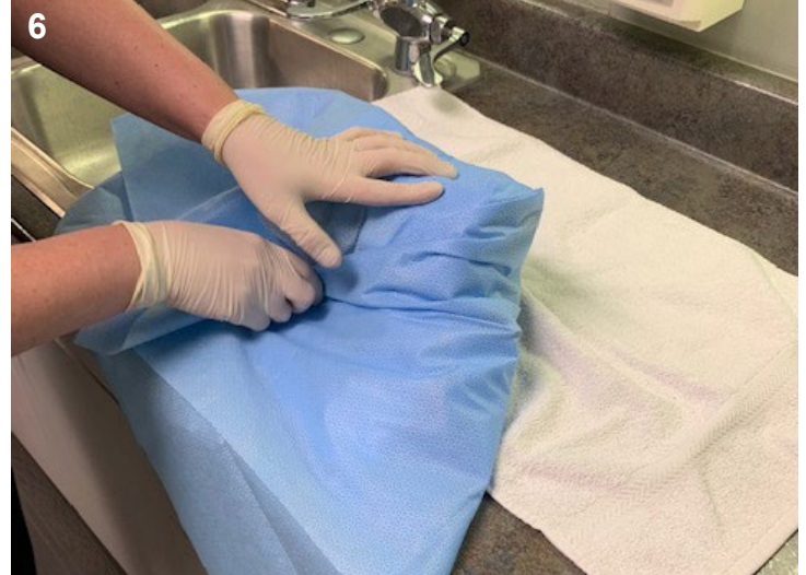
Second fold right apex folded to middle secured with thumb