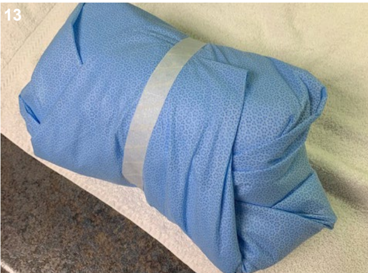
13 Pack secured with circumferential autoclave tape